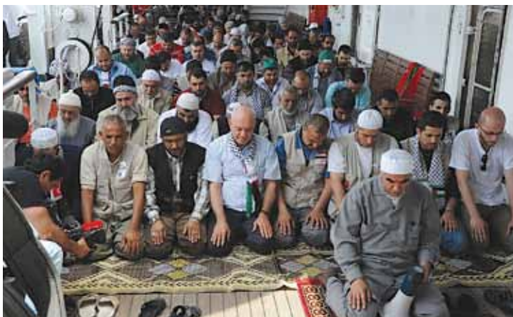
Sheikh Raed Salah leading a prayer in congregation on the Mavi Marmara

the reasons for these chains are being overthrown one by one. These people that are emancipated are now preparing for new roles: to support the causes of Palestine, al-Quds and Masjid al-Aqsa, and to help all the oppressed people of the world.